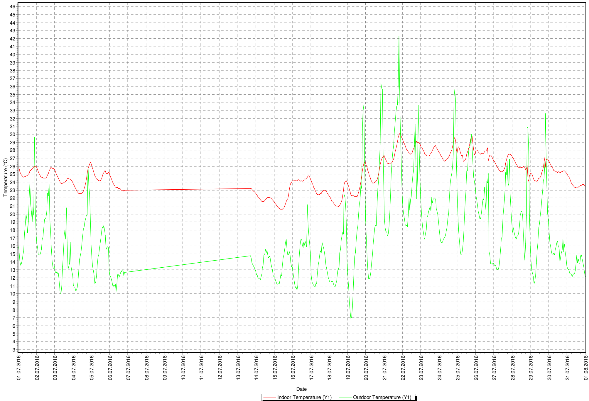
2016 Juli Temperatur og Trykk

Indoor Temperature (Y1) Outdoor Temperature (Y1)